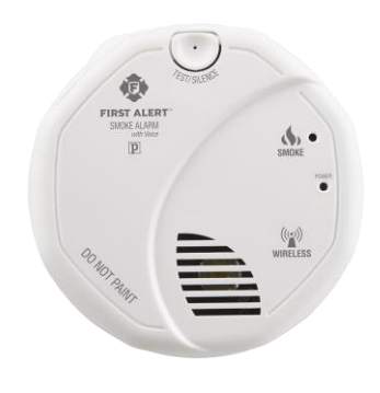
First Alert Smoke/CO Alarm