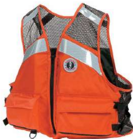
Mustang ® Survival Mesh Life Vests