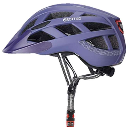
LIMITED SUPPLY Kids Bicycle Helmets (comes in white, gray, magenta, purple, or blue)