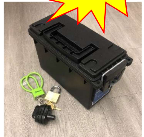
Gun Safety kit (1 box & lock, trigger lock, cable lock) $25