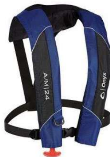
Onyx ® Inflatable PFD (comes in blue, pink, or camo)