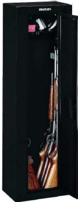
Steel 8-Gun Security Cabinet $99