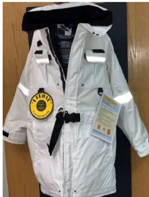
Stearns ® White Float Coat (down from $350!)