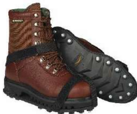
STABILicer™ Maxx (size XL only) $40