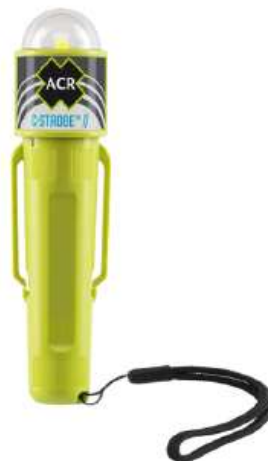
Personal Strobe Light $19