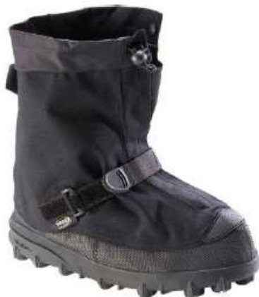
STABILicer™ Overshoe $40