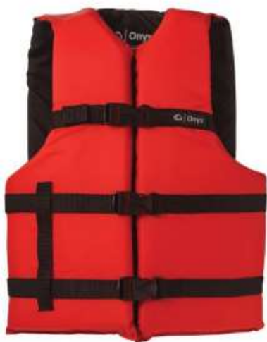
Onyx ® Life Vests (comes in red or blue)