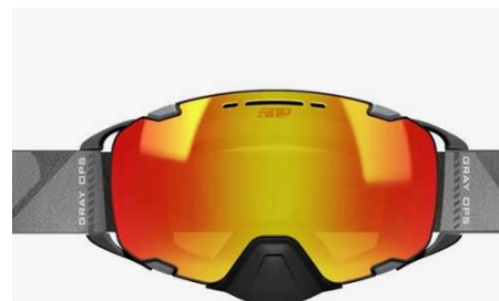
Snow Machine Goggles