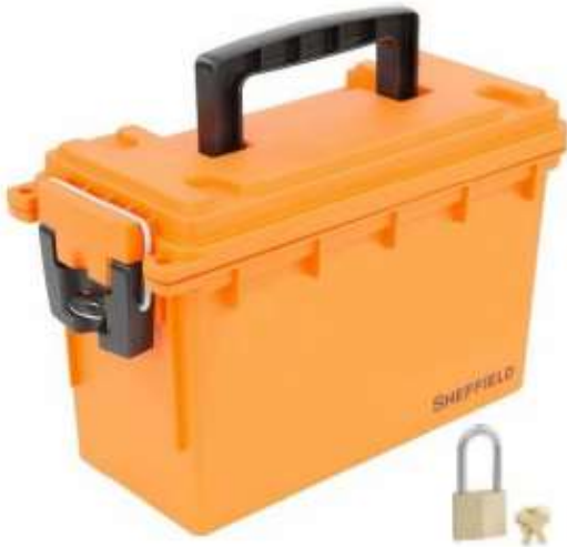
Ammo Box & Lock $19