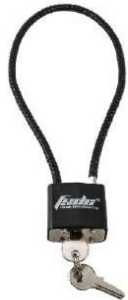
Cable Lock $7