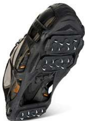
STABILicer™ Walks $20

Ice cleats are FREE for pregnant women and elders