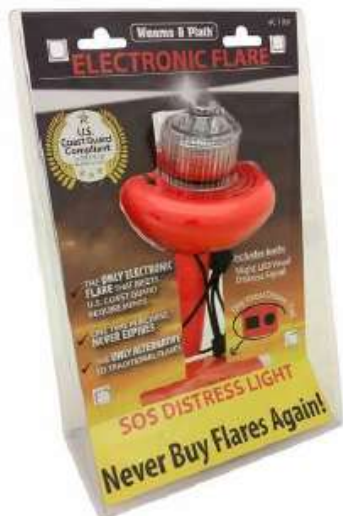
Electronic Flare $90