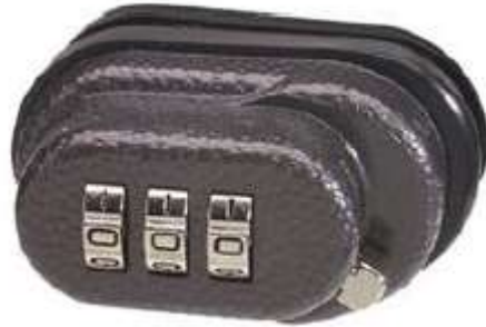
Trigger Lock $9