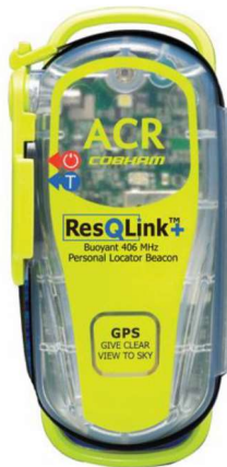
ACR ® Personal Locator Beacon $235