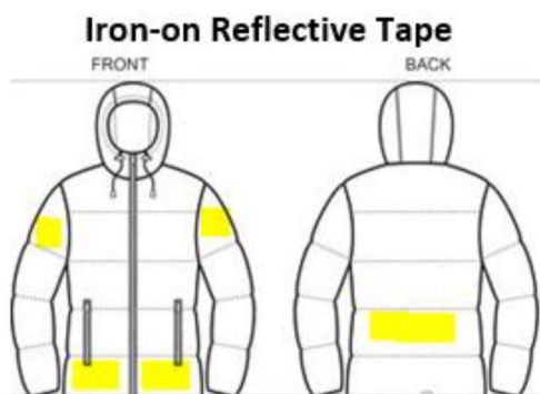
Iron-on Reflector Tape FREE