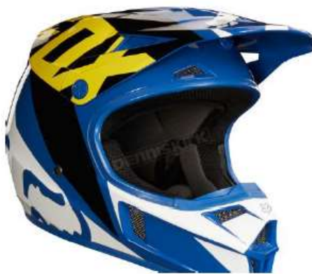
Youth ATV/Snow Machine Helmets (Sizes YS-YL)