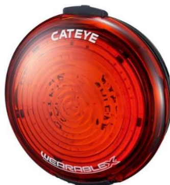
Cateye Wearable Light $40