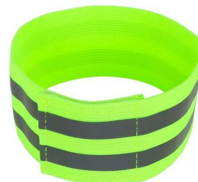
Reflective Arm Band $2

Ice cleats are FREE for pregnant women and elders