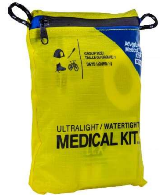
First Aid Kit $20