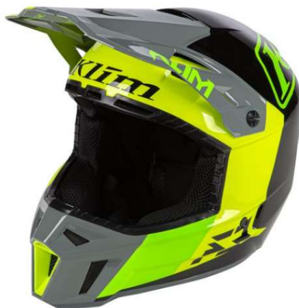
Adult ATV/Snow Machine Helmets (Sizes XS-2XL)