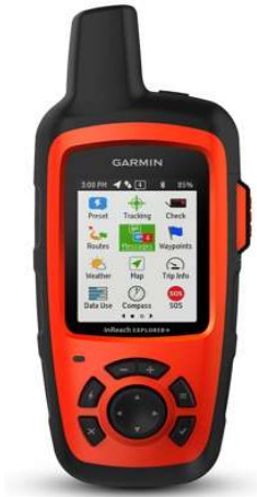
Garmin ® inReach Explorer + (Requires a subscription plan) $435

We accept cash, check, and credit cards as payment options, or payroll deduction for Maniilaq employees. Our injury prevention items are only available for purchase by residents of the Maniilaq service area.