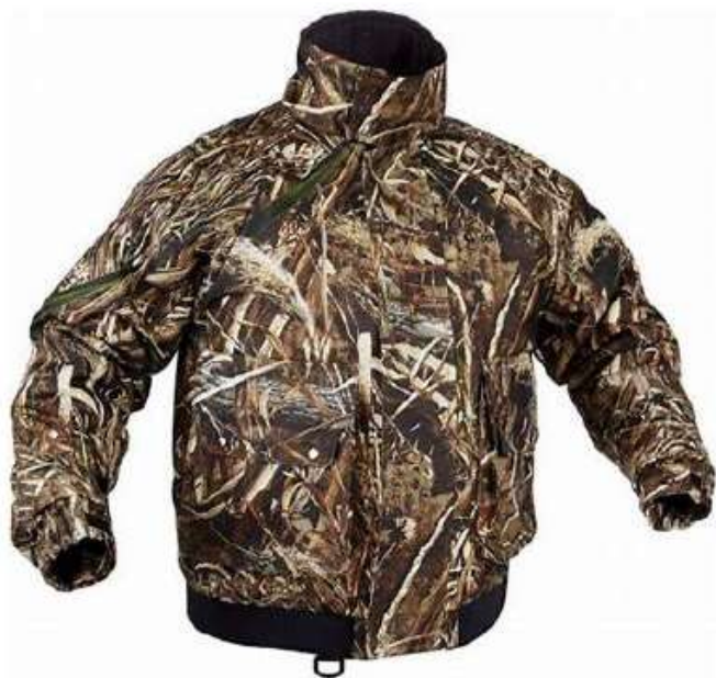
Onyx ® Max5 Float Coats (also in navy blue)