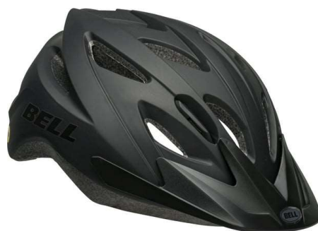
Adult Bicycle Helmets (comes in black and white)